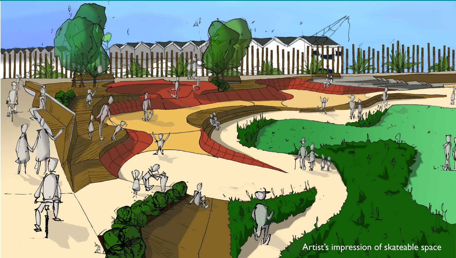
Artist's impression of skateable space