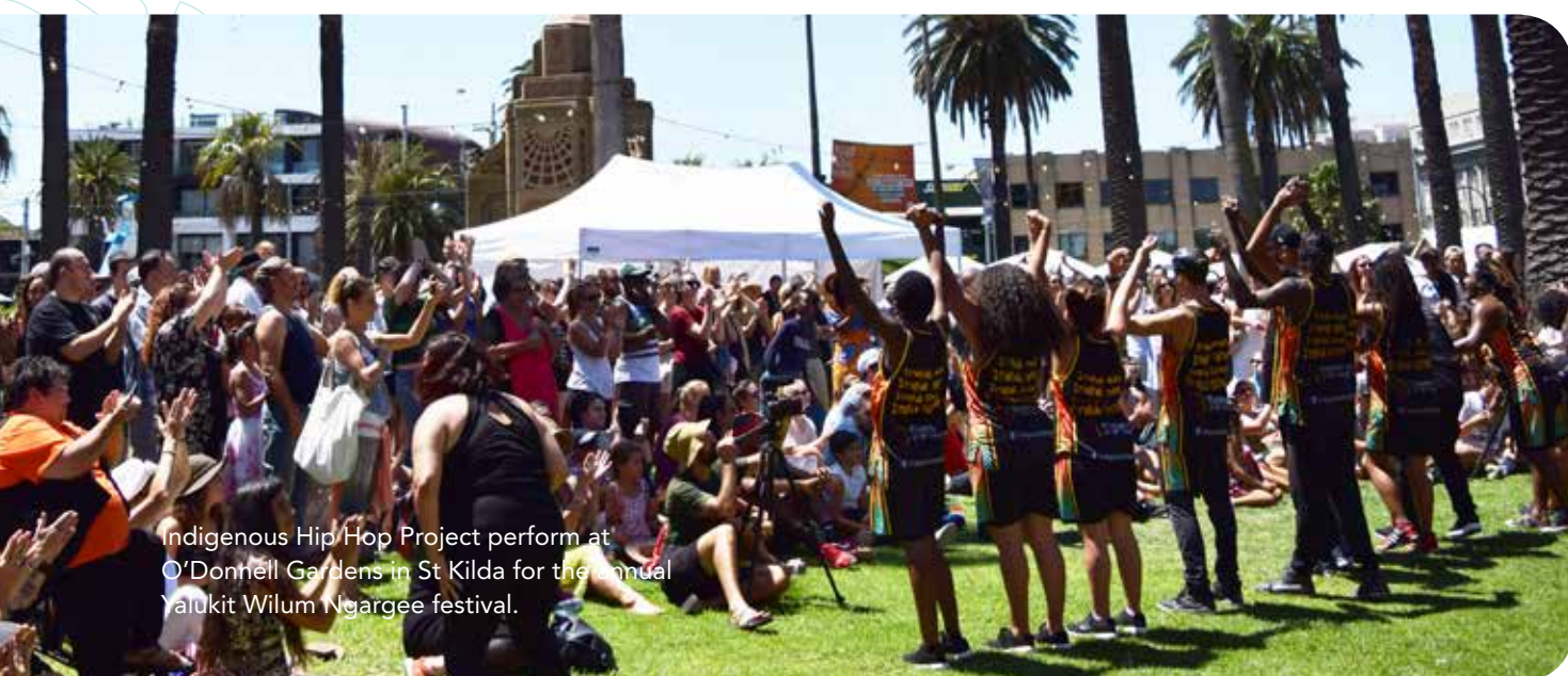
Indigenous Hip Hop Project perform at O'Donnell Gardens in St Kilda for the annual Yalukit Wilum Ngargee festival.