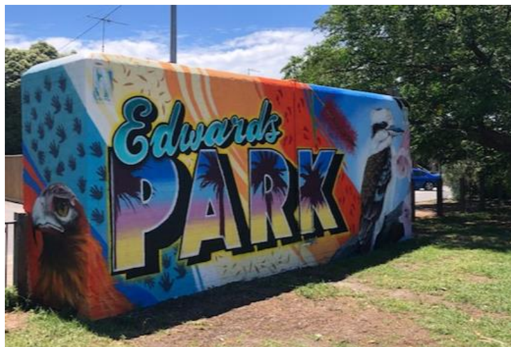
Edwards Park Art Project supported by the Victorian Government's Community Crime Prevention Program