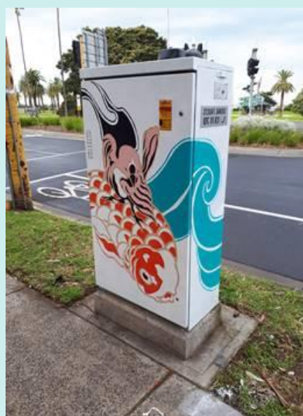
Fitzroy Street, Vic Roads Signal Box After