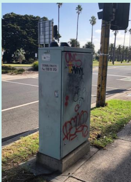
Fitzroy Street, Vic Roads Signal Box Before

Council have worked hard to improve relationships with utilities suppliers, transport providers and other government agencies servicing our city in order to improve outcomes for our community. This program is an example of the collaboration in practice. Since the artwork has been installed there has been only one instance of graffiti to the units, which has been quickly and easily removed thanks to an anti-graffiti coating installed to protect the integrity of the treatment.