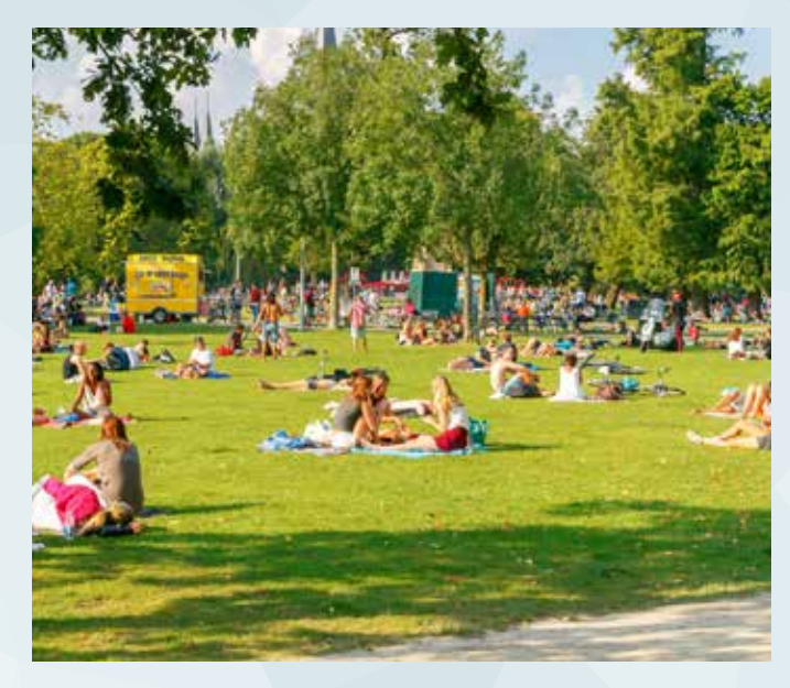
Creating new urban spaces that activate our shopping streets and reflect the cultural identity of the local neighbourhood.