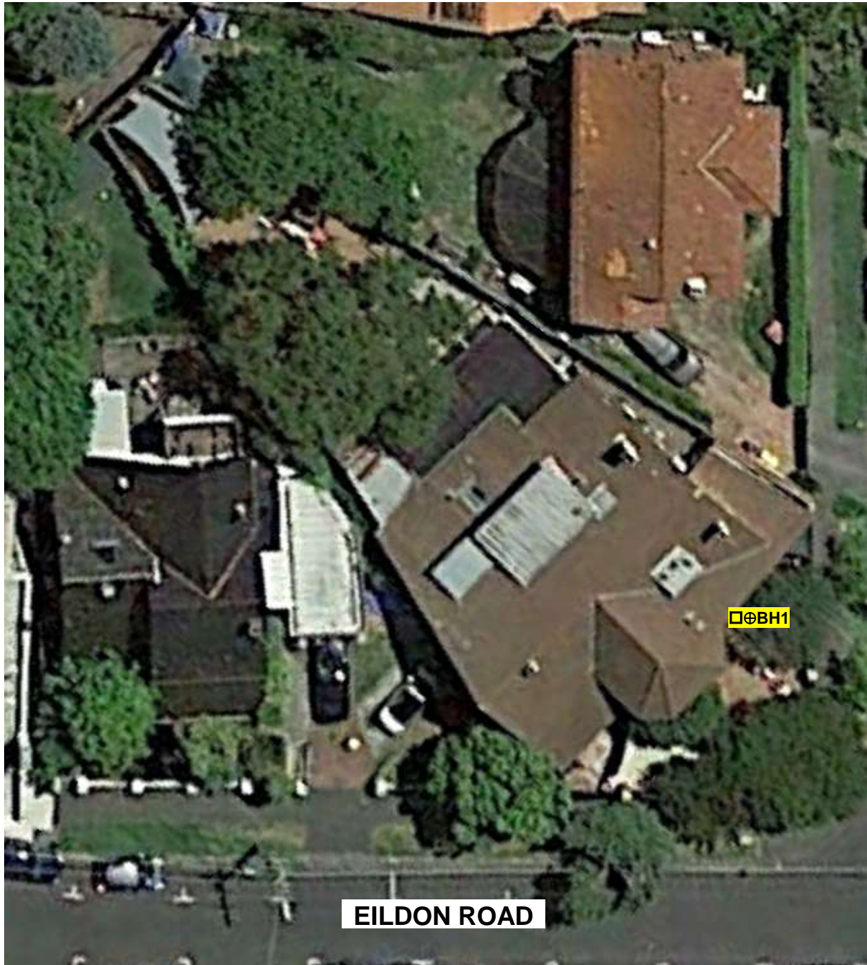
Figure No. 1