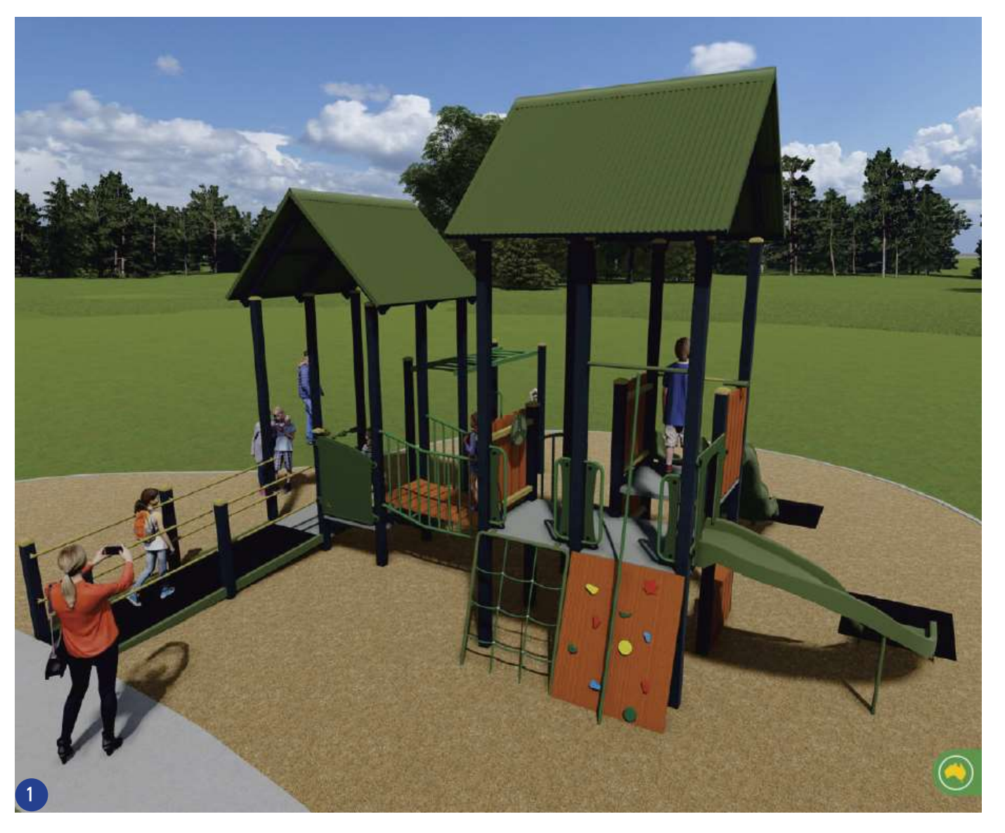
Play Equipment Unit - Looking south