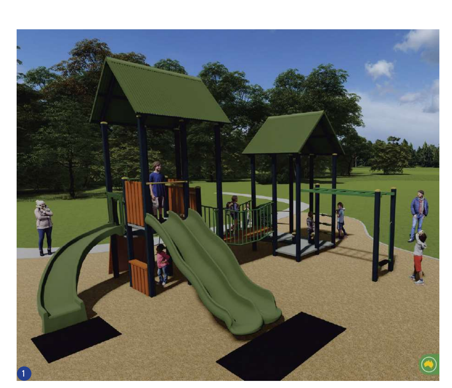
Play Equipment Unit - Looking north