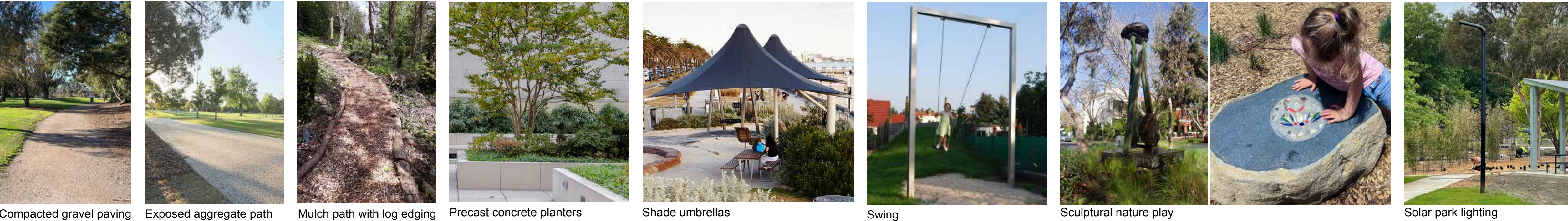
Compacted gravel paving to match existing Exposed aggregate path similar in appearance to compacted gravel paths Mulch path with log edging to both sides Precast concrete planters Shade umbrellas Swing Sculptural nature play Solar park lighting Solar park lighting