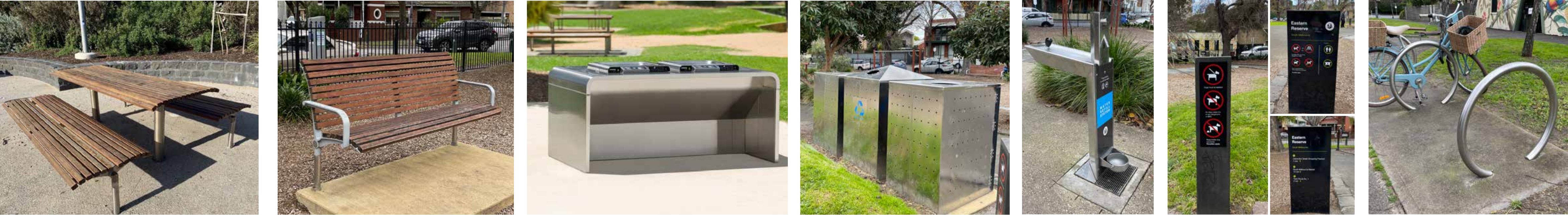
Council standard timber picnic setting Council standard timber seat Stainless steel BBQs suitable for use by all abilities Council standard stainless steel bins Council standard stainless steel drinking fountain with dog bowl Council standard park signage Council standard stainless steel bike hoops