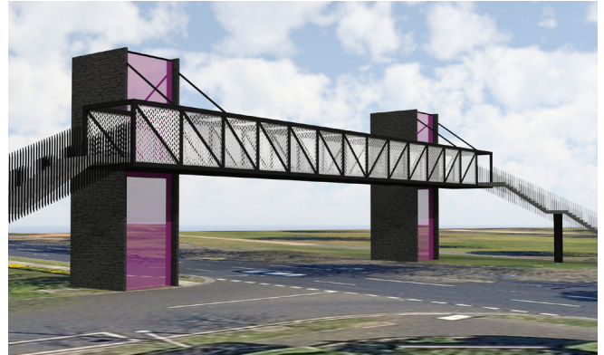
Artist impression view from street

The report is at concept stage only and provides a high-level overview of the Queens Road precinct, its intersections, heritage significance, traffic movement, open space and commercial connectivity, transport linkages and physical constraints. Further indepth investigation across all of these topics is required to determine the most suitable location and design.