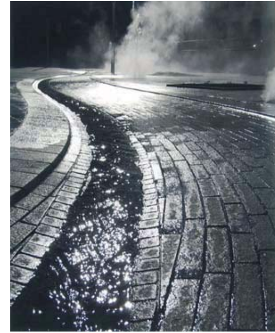
REFERENCE IMAGES – MIST GARDEN (Integrated into new forecourt native garden triangles)