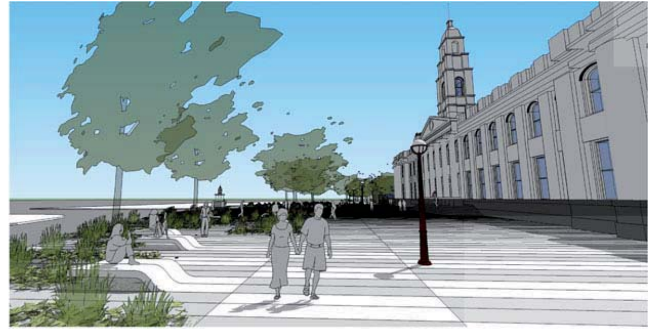
PEDESTRIAN / BICYCLE PATH - CENTRAL FORECOURT