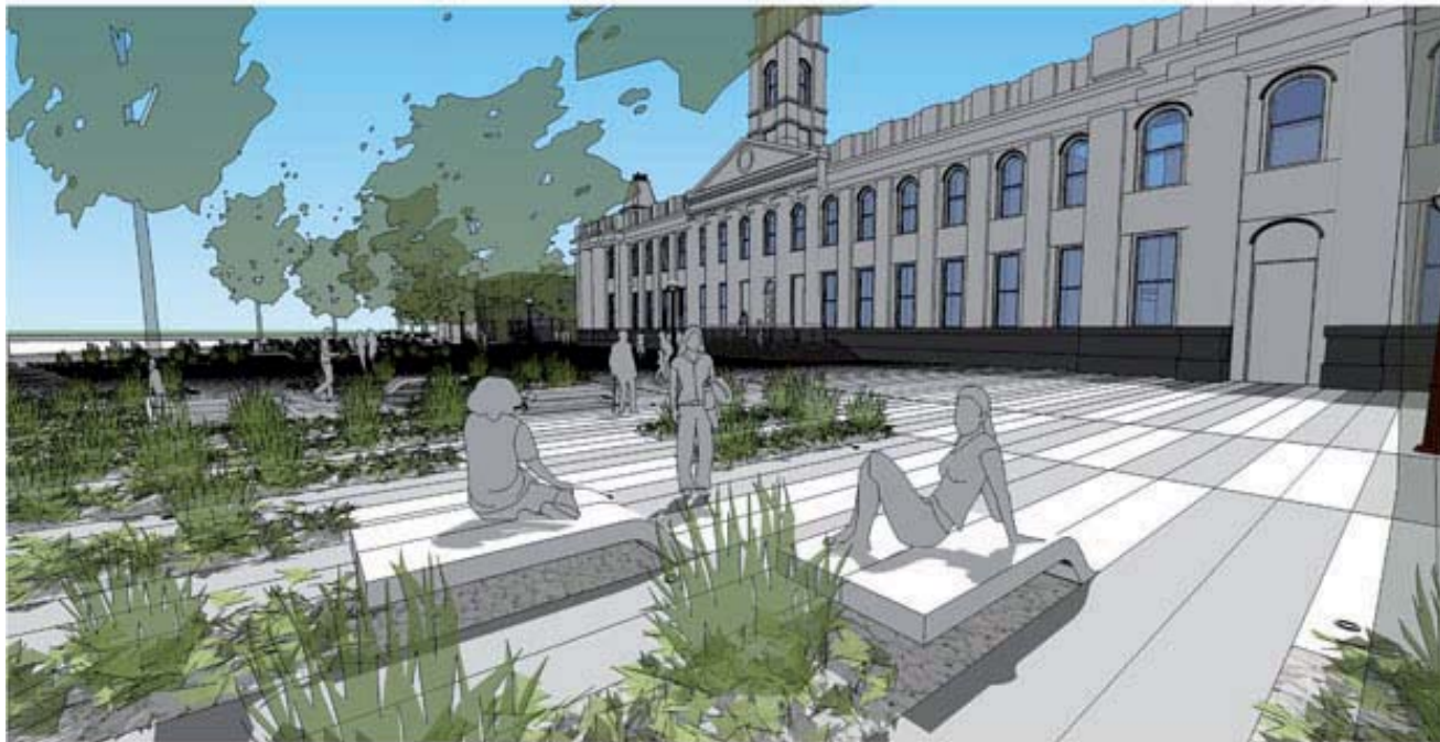
NATIVE GARDEN & PUBLIC SEATING