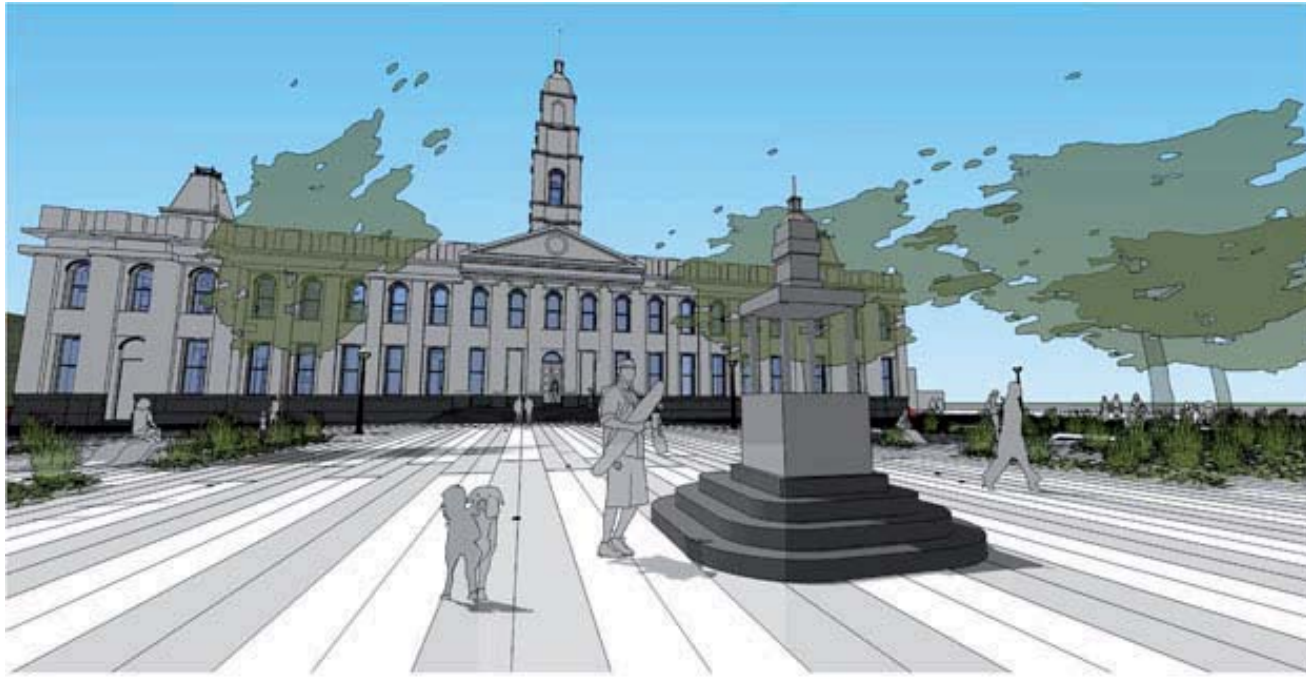
HERITAGE JUBILEE FOUNTAIN