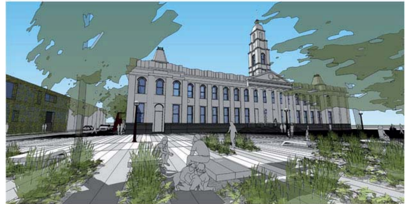
NATIVE GARDEN & PUBLIC SEATING