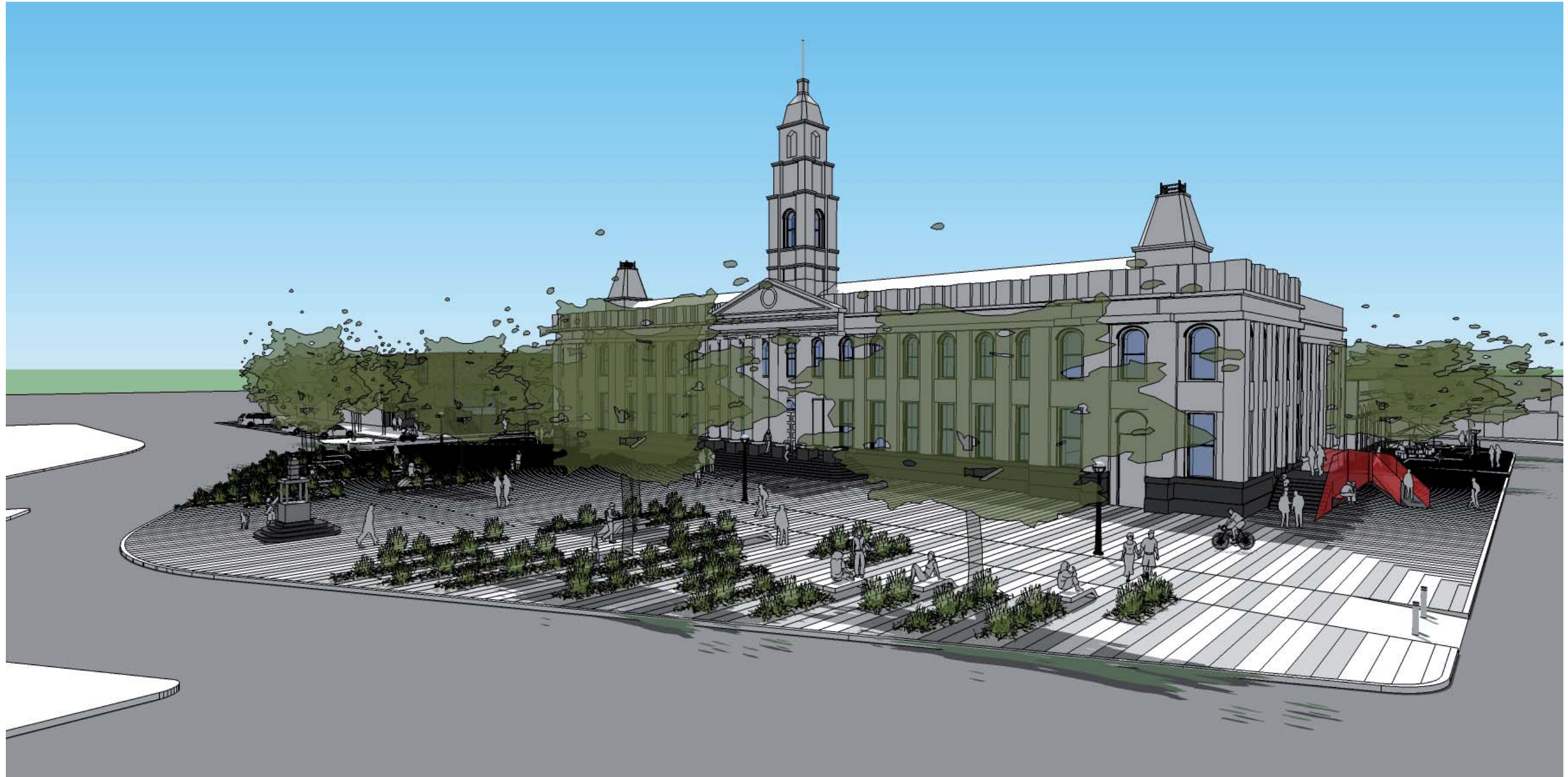
TOWN HALL FORECOURT PERSPECTIVE