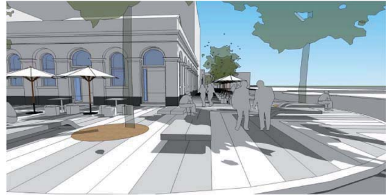
NORTH-EAST CORNER: NEW PUBLIC SEATING AREA