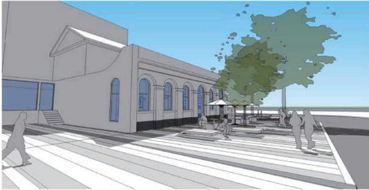
EXTENDED LOADING DOCK - DEFINITION OF BALLANTYNE BUILDING FORM