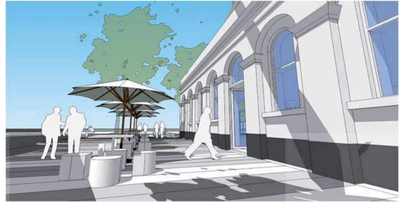
DALY ST - MAIN ENTRY