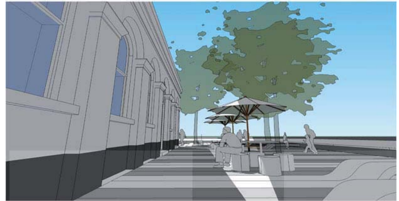
LAYFIELD ST - EAST FACADE