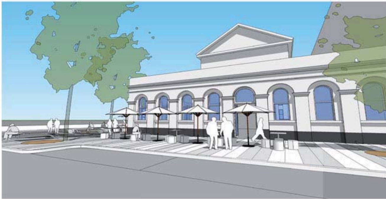
DALY ST - NORTH FACADE