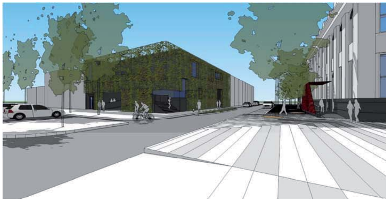
VIEW FROM TOWN HALL FORECOURT