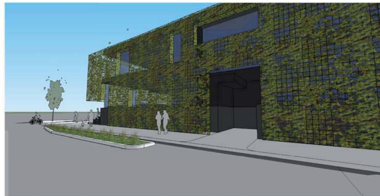
VIEW FROM FISHLEY ST