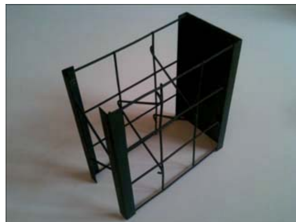
222 BANK ST: NEW ACTIVATED FACADE AND STREET RELATIONSHIP