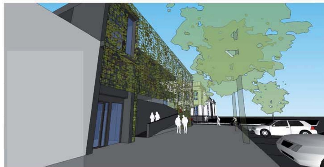
VIEW FROM BANK ST