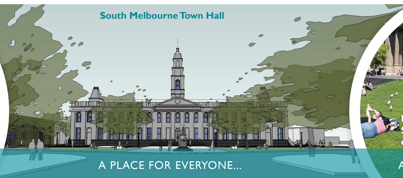
South Melbourne Town Hall