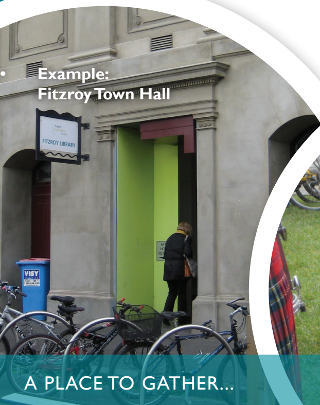
Example: Fitzroy Town Hall

For more information, please view the complete draft master plan at www.portphillip.vic.gov.au/haveyoursay