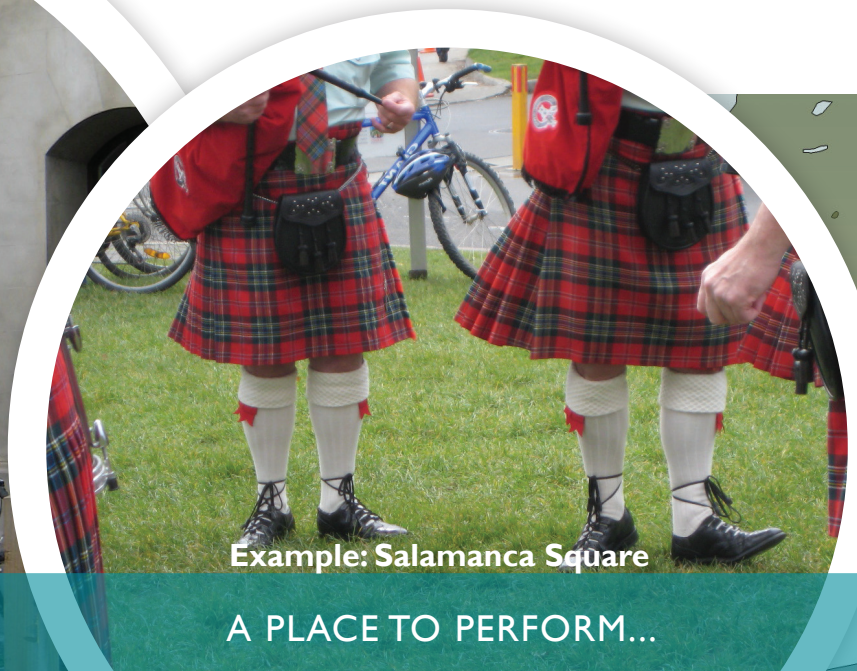
Example: Salamanca Square