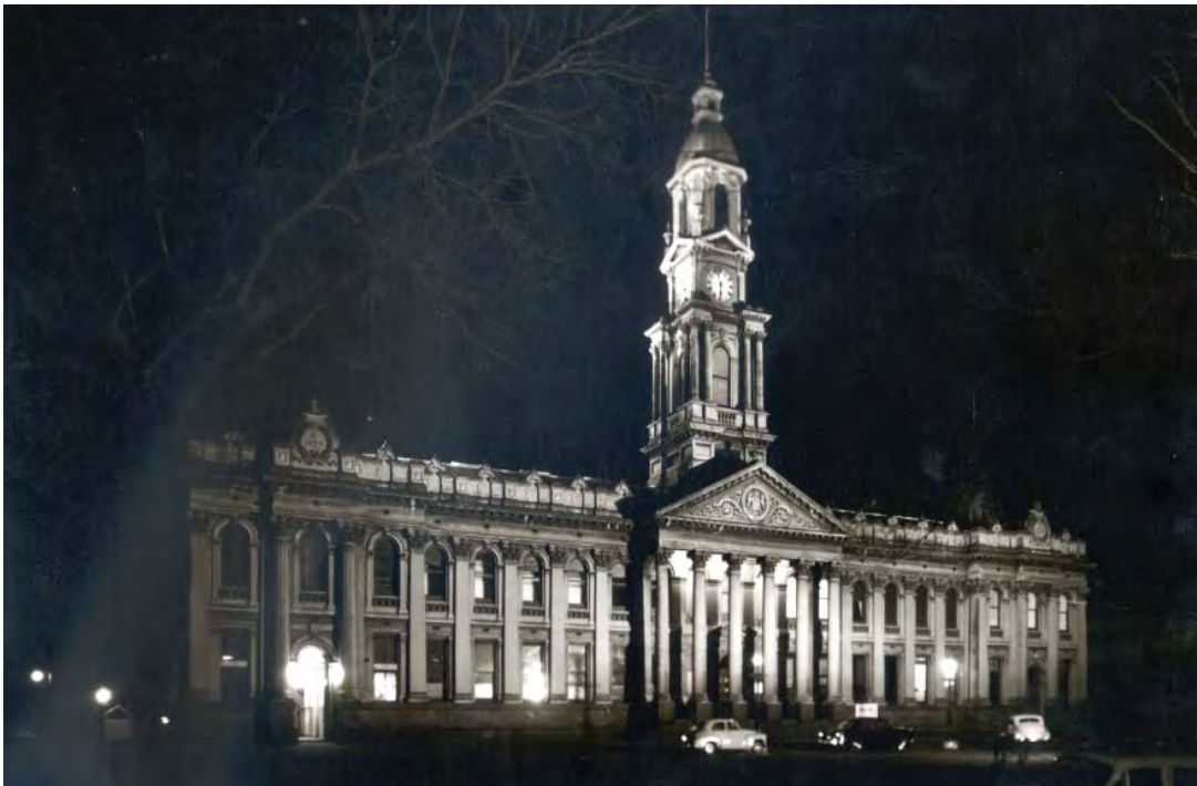
Lighting scheme circa 1950