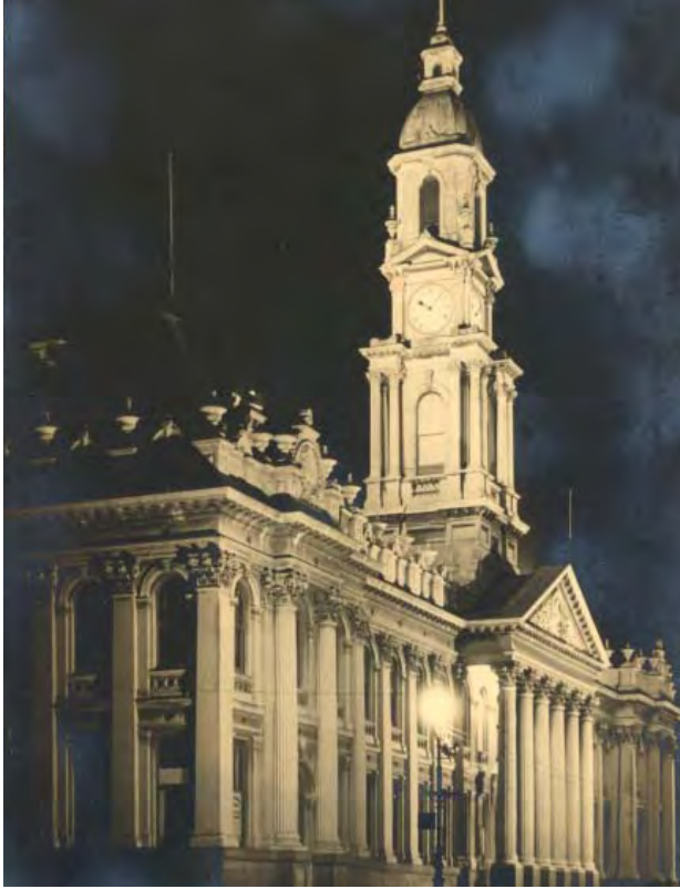
Lighting scheme circa 1934