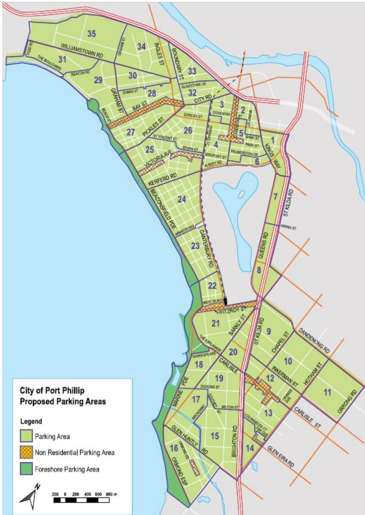
Figure 3: Residential Parking Area map